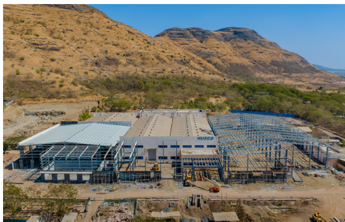
Pune, India facility expansion will be completed in early 2026.

Our recent expansion in Pune, India — tripling our production footprint there — underscores this commitment, bringing significant new Off-Highway production capacity to support global demand and accelerate product delivery across our customer base.